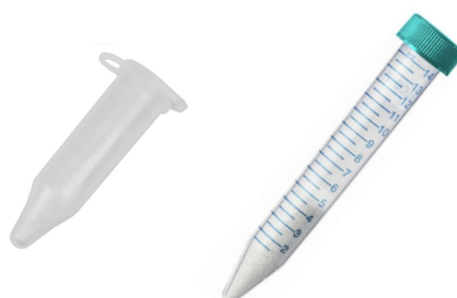
dSPE Columns, CHROMABOND® QuEChERS Mix XII, 15 mL centrifuge tubes, CHROMABOND® QuEChERS Mix XX, 2 mL centrifuge tubes

There are CHROMABOND® QuEChERS mixes available that are especially suitable for sample preparation of PFAS in: Dairy products, Bread, Lettuce and Fish