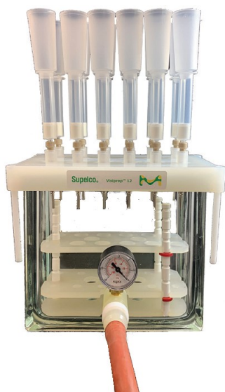
Figure 1. Visiprep™ large volume samplers, Supelclean™ SPE cartridges, and Visiprep™ vacuum manifolds provide a complete sample preparation solution for PFAS analysis.

Optimized sample clean-up and concentration is vital to achieve accurate and precise results. A range of vacuum manifolds, solid phase extraction (SPE) cartridges, and large volume samplers are available to support your PFAS sample preparation needs (Figure 1).